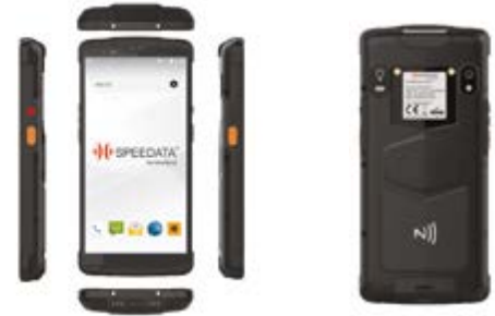
SD55 from all sides